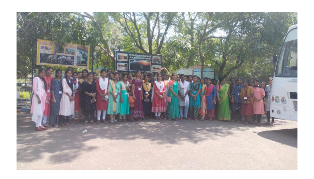
Industrial Visit Report

An Industrial visit has been organized by the Department of Physics, Krishnasamy College Of Science, Arts And Management For Women, Cuddalore, for III B.Sc., students of nineteen on 13<sup>th</sup> February, 2023 for the academic year 2022-23 to Tamil Nadu Science and Technology Centre. Tamil Nadu Science and Technology Centre has established the following centers: Periyar Science and Technology Centre with B.M Birla Planetarium at Chennai,